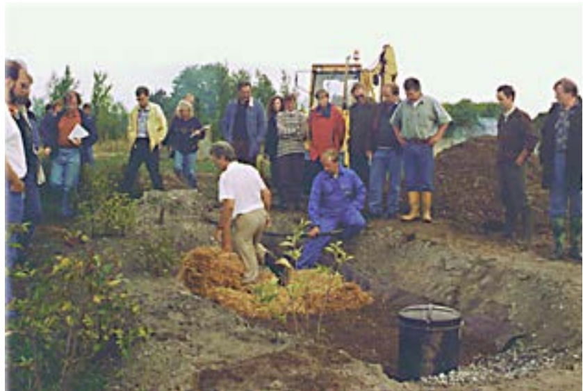
ROTZONEN I PEGASUS TRÄDGÅRD I HÖG